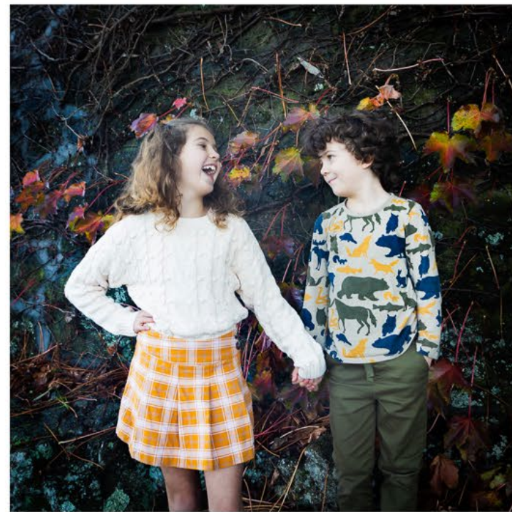
Autumn Leaves Siblings